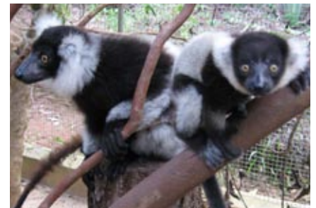
Dawn and baby

Not surprisingly the babies are proving to be a big draw for visitors to the park.