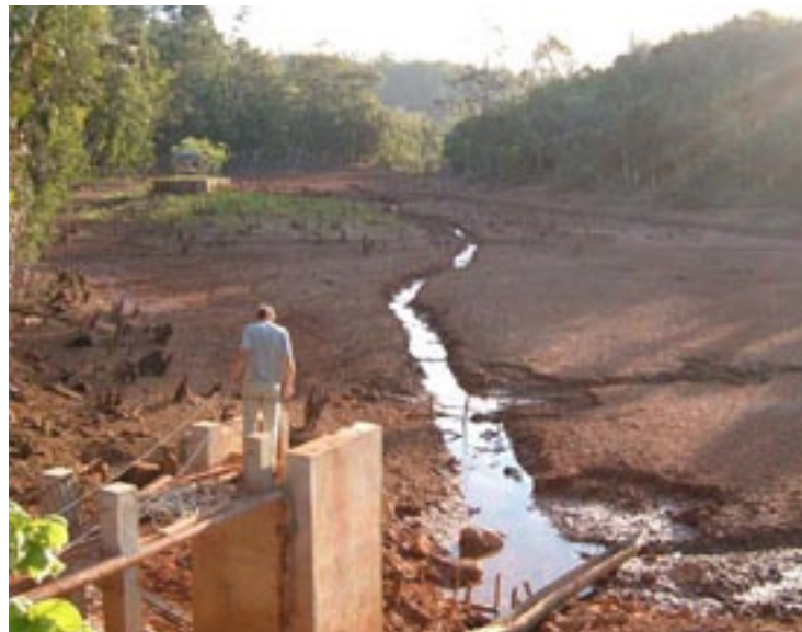
The Lake Empty