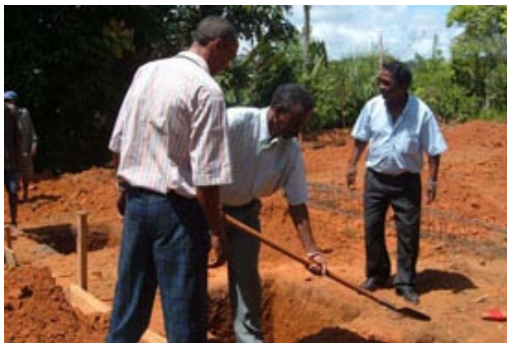
The PDS placing the first shovel of concrete.

Training Centre: The President of the Special Delegation of Tamatave (PDS) came to Ivoloina accompanied by an entourage of local political, educational, military and police representatives to place the ceremonial first shovel of concrete in the foundations of the new environmental training centre. The event, which was covered by national television, was a great success and marks the official start of the construction phase of the project. Once the planned improvements to local infrastructure are in place, the training centre is expected to become a major provincial environmental research and training facility.