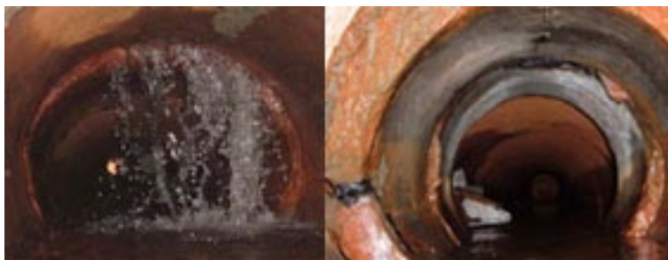
The problem ...

Lake & Dam Update: Over the past 10 years, problems with the Ivoloina dam have caused MFG repeated headaches. The latest repair has been successful and involved yours truly spending a considerable amount of time in the pipe beneath the dam installing reinforcing pipe sections. The lake, which covers approximately 30 ha is now full. We have also replaced 70 rotten or defective water-retaining planks. As well as the obvious aesthetic benefits, pirogue rides and lakeside trail, the lake also supports an abundance of aquatic and avian life, and provides cooling breezes in the intense heat, for zoo animals, staff and visitors alike. Yet the pipe beneath the dam is old and constantly being eroded. The recent pipe reinforcements will outlast the remainder of the pipe, but it is only a matter of time before the entire pipe will have to be replaced. Many thanks to British engineer Mark Tyler who offered valuable advice on the dam repairs.