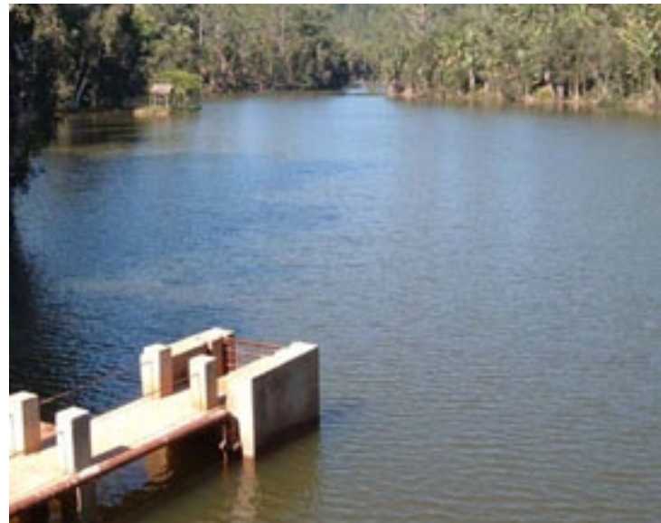
The Lake Full

Temporary Setbacks: It often happens in Madagascar that you think that you have achieved something, only to find that fate has conspired to undo it. So it was with the Protocol of Collaboration between MFG and the National Association for the Management of Protected Areas (ANGAP). Confused regional and national level responsibilities within ANGAP have meant, frustratingly, that December's signing of the Protocol of Collaboration was not legitimate and that there are still some amendments to be made. We are optimistic that the ultimate agreement will work in MFG's favour.