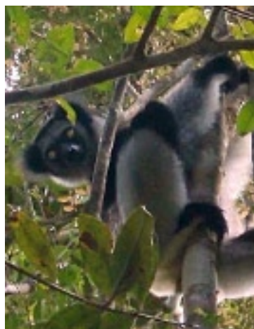
Indri - a year off parenting

Masoandro (released in January 2001) is thought to have paired with a wild sub-adult female. And worryingly, Tany (released in January 2001) has not been seen since mid-December. It hasn't been a good lemur breeding season, with no sightings of baby indri ( Indri indri ), one diademed sifaka ( Propithecus diadema diadema ) baby and only a few single white-fronted lemur ( Eulemur fulvus albifrons ) infants, when normally there would be some twins.