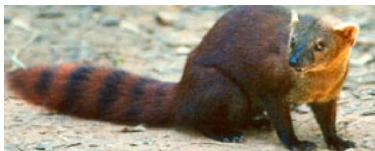
Cocky mongoose!

Mongoose Encounter: The main trail into the Betampona forest from Rendrirendry climbs steeply for a couple of kilometres before levelling out on a forested mountain crest. This spot serves as a resting point for the Betampona conservation agents before they continue their day's work. On 30 December the team were taking a short break here when they were joined by a cocky ring-tailed mongoose ( Galidia elegans ). It wandered around on the path in front of them, less than 5 feet away for five minutes before ambling back into the forest. This notoriously bold, diurnal species is the most common and widespread of Madagascar's mongooses (Bradt 1996), but has never before been observed at such close quarters at Betampona.